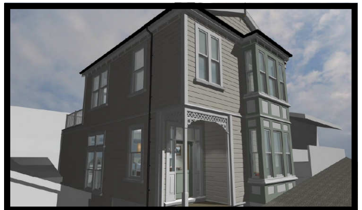
Canterbury Street, Lyttelton