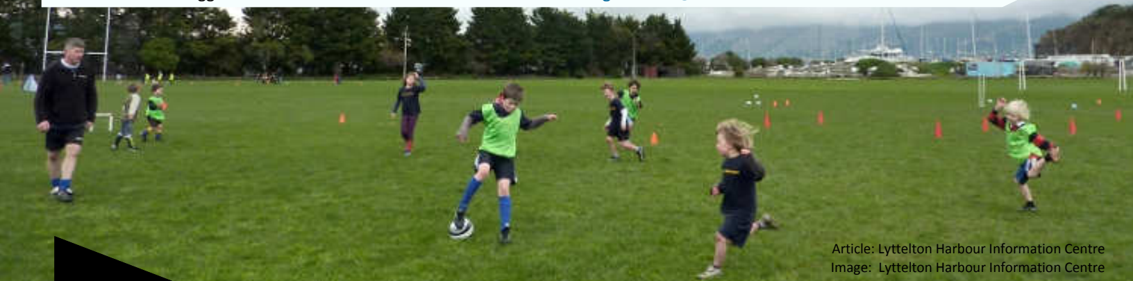
Article: Lyttelton Harbour Information Centre Image: Lyttelton Harbour Information Centre

Contact: Andrea Boggiani 03 328 8903 or mobile 021 264 6614 or email gatti2cani@clear.net.nz