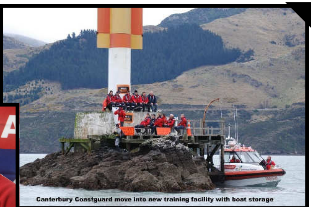
Canterbury Coastguard move into new training facility with boat storage