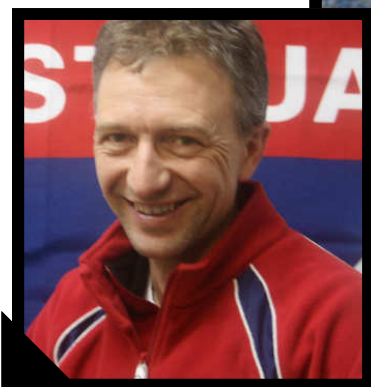
Article and Images: Coastguard Canterbury