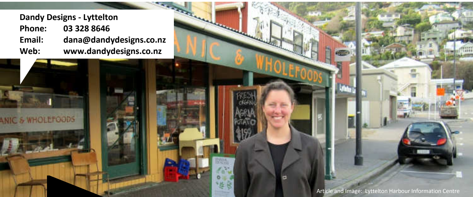
Article and Image: Lyttelton Harbour Information Centre