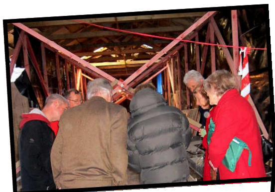
Community Board peruse development plans.