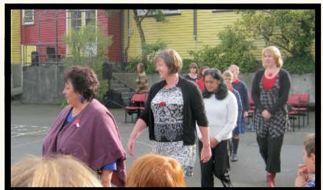
Above: For the greeting