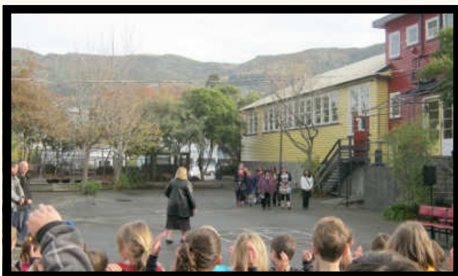
Above: Calling the new people into the school