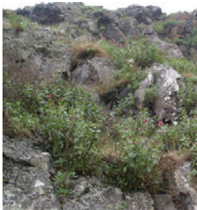
Spur valerian invading a rocky outcrop