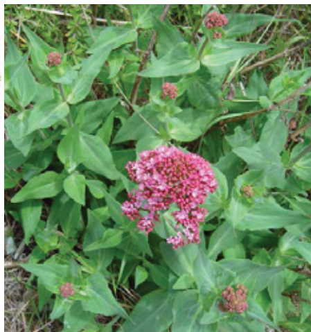
Spur valerian flowering