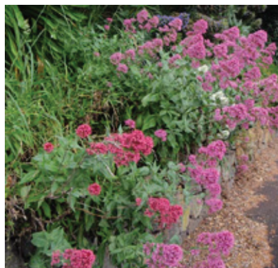
Spur valerian

If you have spur valerian in your garden consider removing it, particularly if you live in a coastal area or close to rocky outcrops.