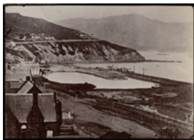
Photo credit: View of Lyttelton and port, 1867, Te Ūaka The Lyttelton Museum ref 14625.29