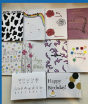
MIXED PACK TWO - BIRTHDAY