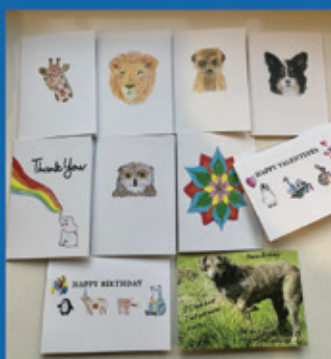
MIXED PACK THREE - ANIMALS