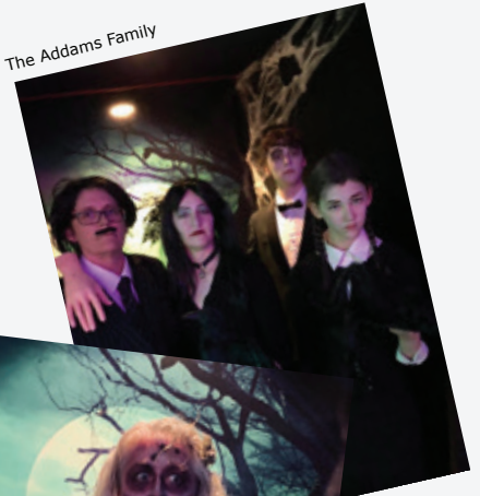
The Addams Family

See you all again next year, for the 2021 Monster Mash Party at the Lyttelton Club.