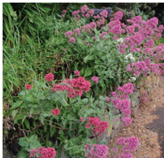
Spur valerian

If you have spur valerian in your garden consider removing it, particularly if you live in a coastal area or close to rocky outcrops.