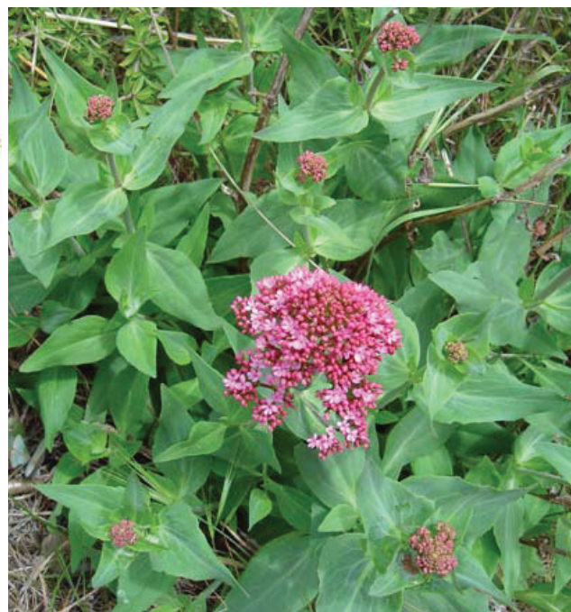
Spur valerian flowering