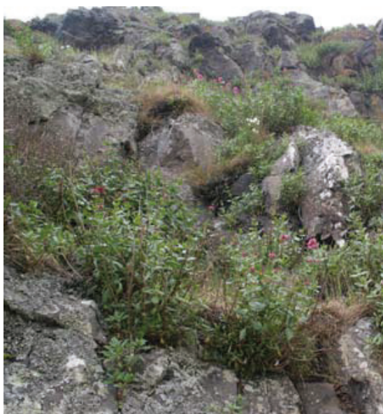
Spur valerian invading a rocky outcrop