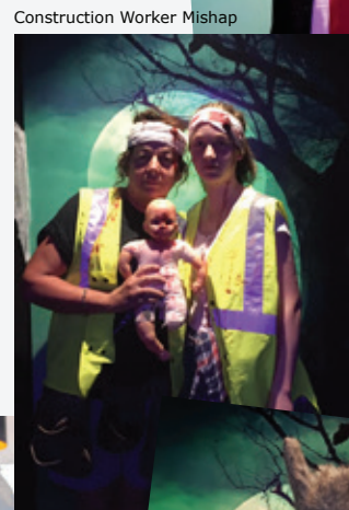
Construction Worker Mishap