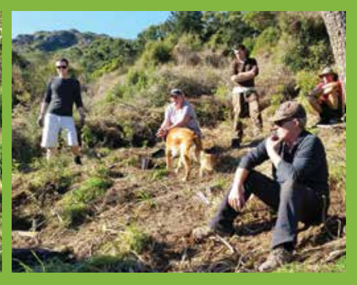
Organised by the Lyttelton Reserves Management Committee.