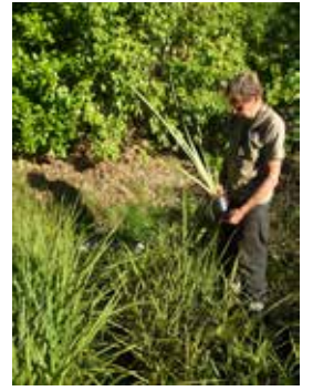
Plant Growing DJs Flax

We have been surprised and amazed at our results. Many of us have never grown plants before!