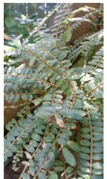
Northern Version Kowhi