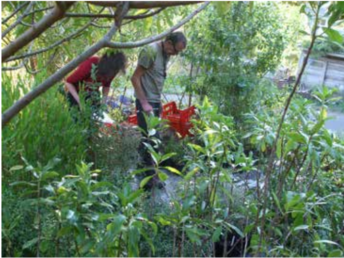
Plant Growing Counting Marbleleaf and Ngaio

The new year is well and truly underway and seed collecting for the Urumau reserve plant propagation project is in full swing. By the time you read this edition of the Lyttelton Review, we'll have made three trips into the hills to look for seeds to grow into plants that we'll plant in Urumau reserve.