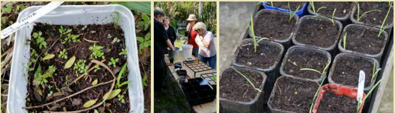
Organised by the Lyttelton Reserves Management Committee.

Workshops run no matter what the weather. Shelter available for potting.