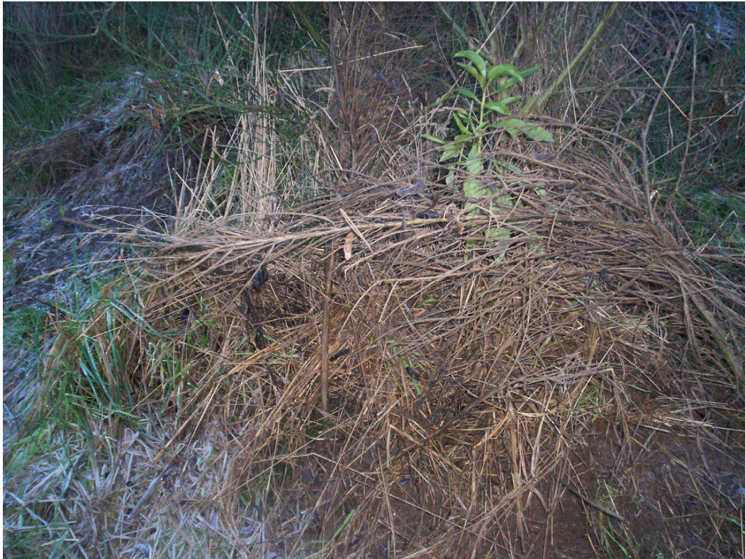
Ngaio, mulched and protected from frost.

preserved to help provide frost and wind protection. The plantings need to be checked regularly and 'released' for the first 2 years and at decreasing intervals after that. During summer supplementary watering may be required depending on the season. All in all hardly instant!