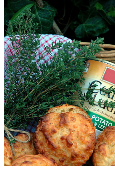
.../ Continued from Cover Story

Today, with the help of a small army of dedicated and hard working garden volunteers the Lyttelton Community Garden is flourishing. With an overall concept plan in place, gardeners muck in whenever they feel like getting down to earth; to come and enjoy the sun on their backs; to take in the view across the harbour; or to enjoy the friendly gardening banter while releasing the stress from the week that has passed.